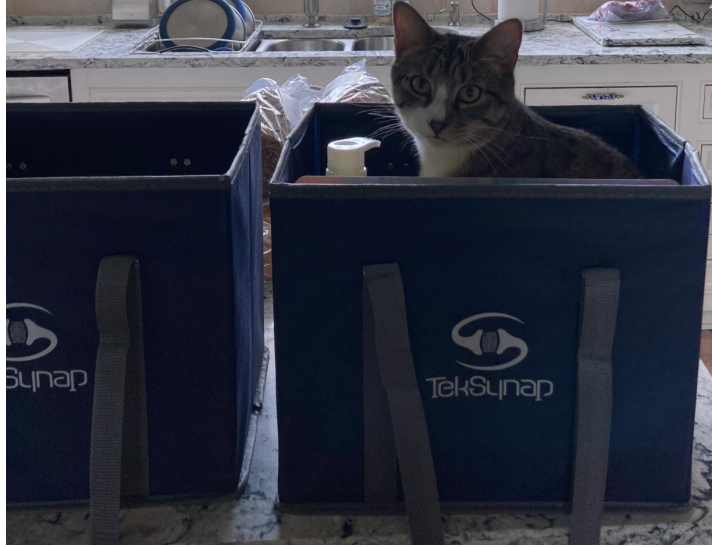
Susan Case's cat Boots is a big fan of TekSynap swag!